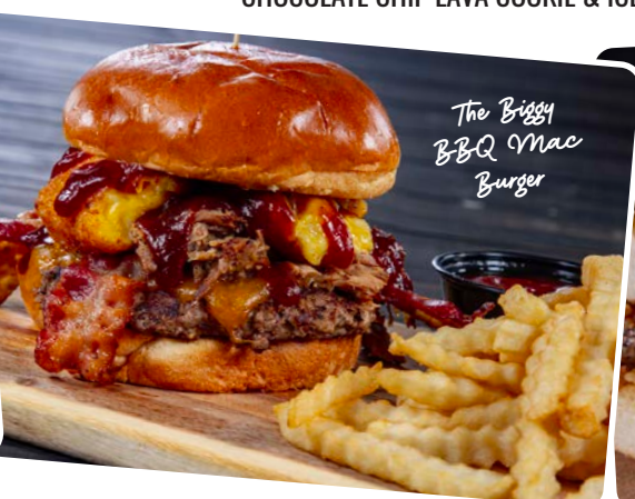
The Biggy BBQ Mac Burger