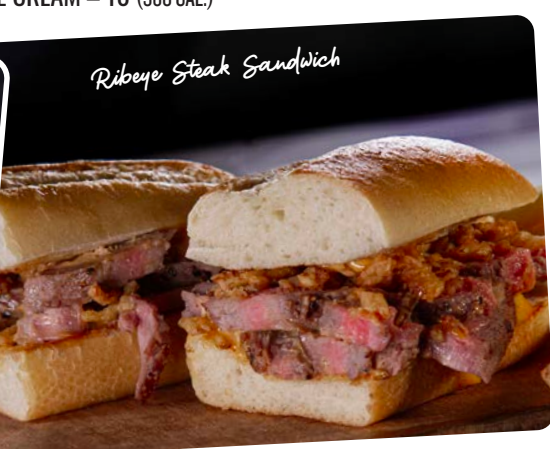
Ribeye Steak Sandwich