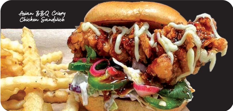
Asian BBQ Crispy Chicken Sandwich

SERVED WITH CRINKLE-CUT FRIES OR TOTS. SUBSTITUTE SIDE SALAD, CRISPY BRUSSELS SPROUTS OR ROASTED BUFFALO CAULIFLOWER – 1 (140 - 410 CAL.)