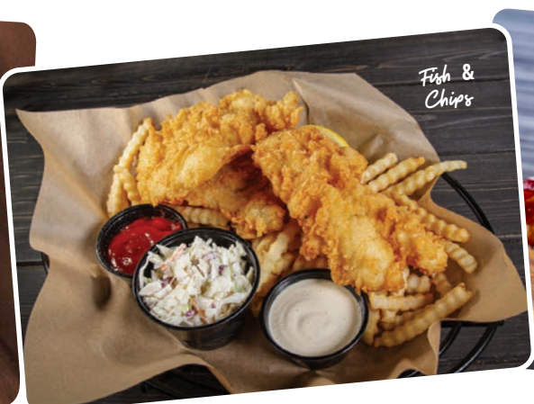
Fish & Chips