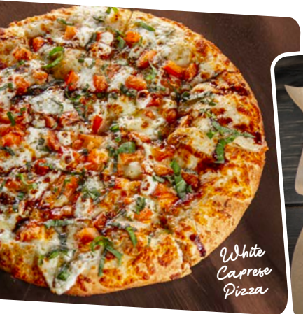
White Caprese Pizza

NEW ASIAN BBQ CRISPY CHICKEN SANDWICH* – 16.5 Hand-breaded, beer-battered chicken breast, Korean BBQ sauce, spicy mayo, coleslaw, pickled red onions, fresh jalapeños & onion cilantro on a butter brioche bun (1670 CAL.)