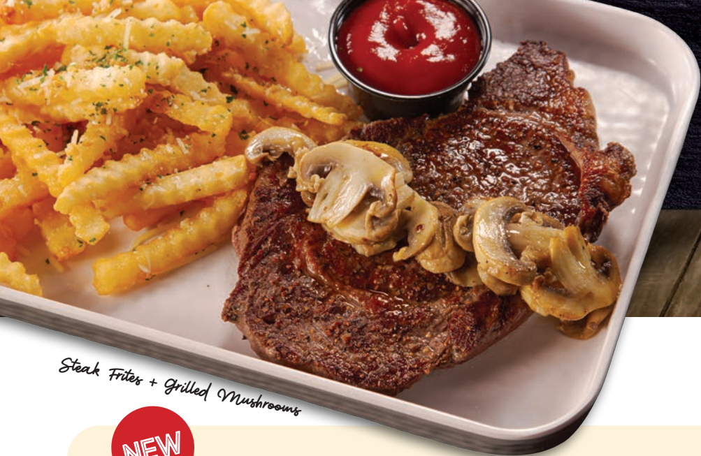
Steak Frites + Grilled Mushrooms