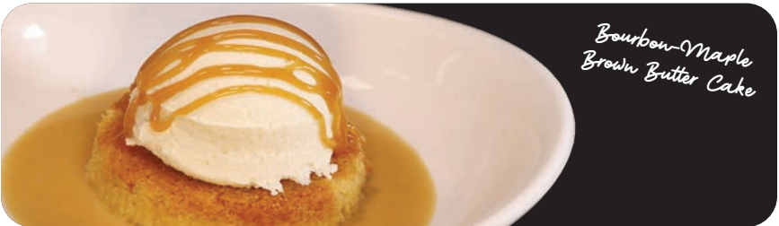
Bourbon-Maple Brown Butter Cake

NEW BOURBON-MAPLE BROWN BUTTER CAKE – 10 Decadent warm brown butter cake, bourbon-maple sauce, vanilla ice cream, caramel. (975 CAL.)