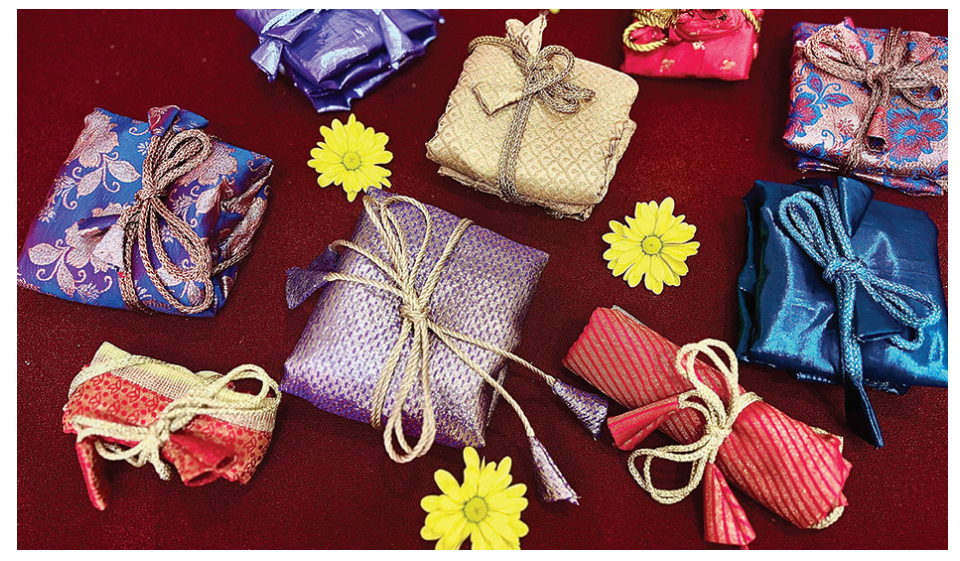
Roopa Srinivas' gift bags can pull double duty as handbags. (Special to GSN)

Made in India, the multipurpose bags also can be used as backpacks, handbags and/or for gift-giving. "They also can